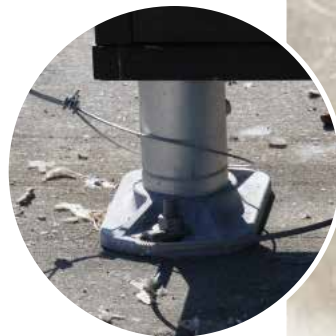
Tethered for safety