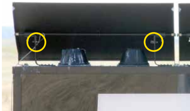
Remove the thumb screws and the Tilt lifts off for maintenance.