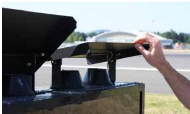
Rotates on bird's landing